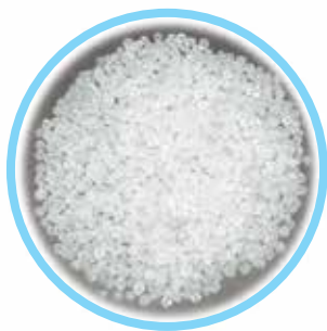
4mm – 5mm Biofilter media

Biological filtration is the most effective method of removing toxins (ammonia) and breaking it down into nitrites and then into nitrates which provide food to your aquatic plants (referred to as the Nitrogen Cycle). This is accomplished by using naturally occurring bacteria and giving it a place to live in the Biofilter media where it is exposed to large quantities of food and oxygen.