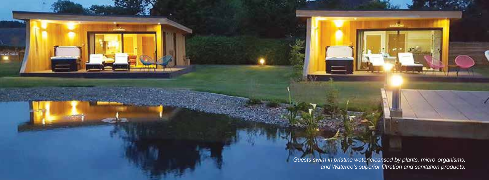
Guests swim in pristine water cleansed by plants, micro-organisms, and Waterco's superior filtration and sanitation products.