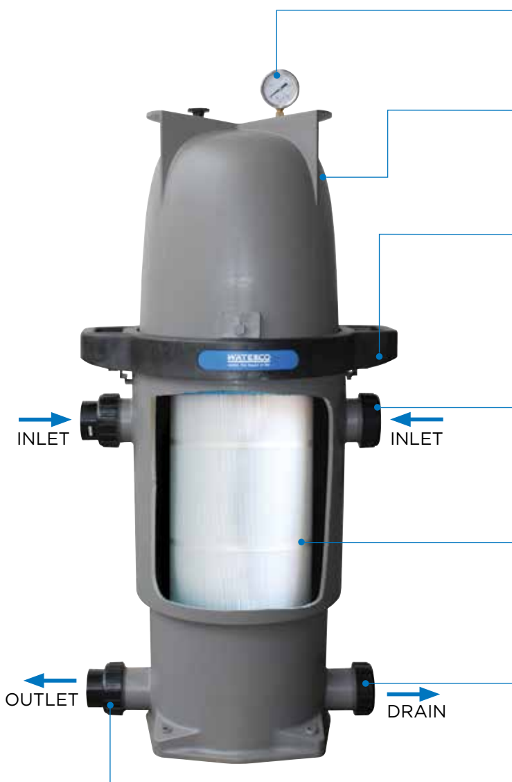
Opal Ultra 350

Easy-to-read pressure gauge allows for quick and simple monitoring of filter performance.