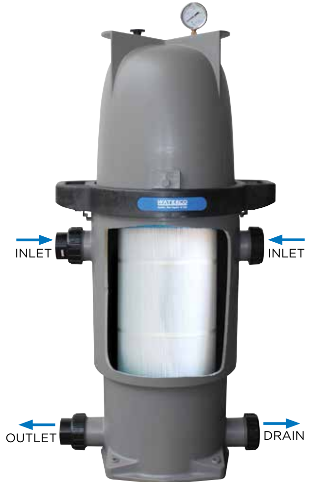
Opal Ultra 350