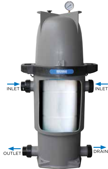
Opal Ultra 350