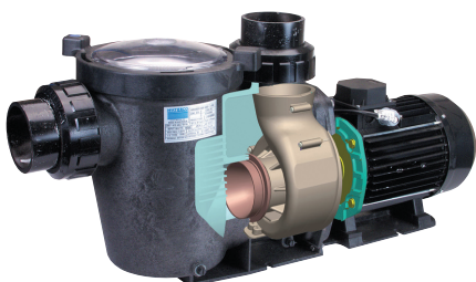
Purposed built for commercial sized swimming pools, Hydrostar pumps efficiently deliver high flow rates and incorporate an innovative quarter lid & lock ring assembly for easy maintenance.