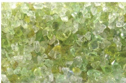
Waterco's Glass filter media is manufactured from recycled glass, it is an environmentally friendly and viable alternative to sand.