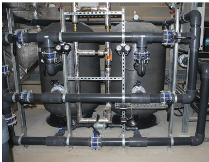
Two SMD1200 Micron Commercial Fibreglass Filters, along with two Hydrostar 4HP pumps; and for the vitality pool, two SMD1050 Micron Commercial Fibreglass Filters and two 4HP Hydrostar pumps for the main circulation and jets.