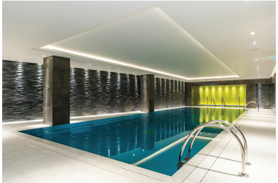
A fully tiled mosaic pool of 125m 3 , and alongside a 30m 3 vitality pool equipped with the latest in air and water jet features.

Designed and built by Aqua Platinum Projects, a multi award-winning company that specialises in high-end residential and commercial projects, both indoor pools needed a superior filtration solution befitting of their luxurious setting.