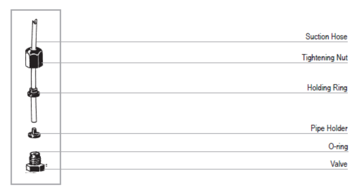
Figure 5.11 Connection Point Assembly6

6.3.2 Take one end of the chemical supply tube and feed it through the tightening nut and holding ring. Then push the end of the tube over the pipe holder. Ensure that the tube is pushed on firmly over the tip and screw the tightening nut hand tight. See the images below.