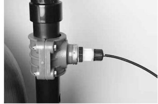
Figure 6.12 Connecting acid feed line to the injector