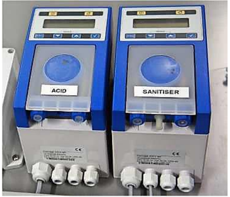
Figure 5.14 LEFT Peristaltic Pump HEAD (pH) RIGHT Peristaltic Pump HEAD (hydrogen peroxide or chlorine )

Repeat, so both tubes are now connected with one end joined to the chemical injection point, and the other joined to the RIGHT-HAND SIDES (discharge sides) of the chemical dosing unit pumps.